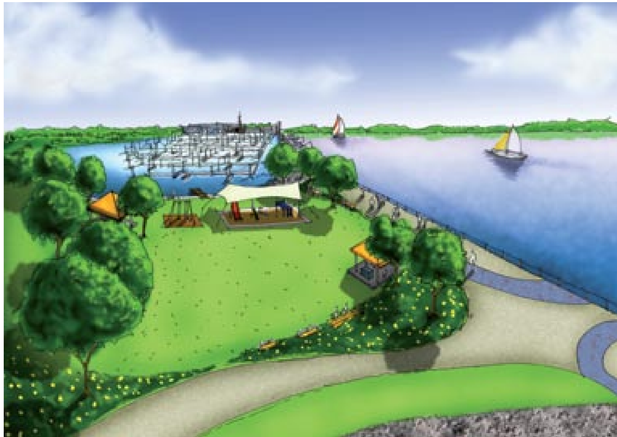
View across new waterfront park to Marina