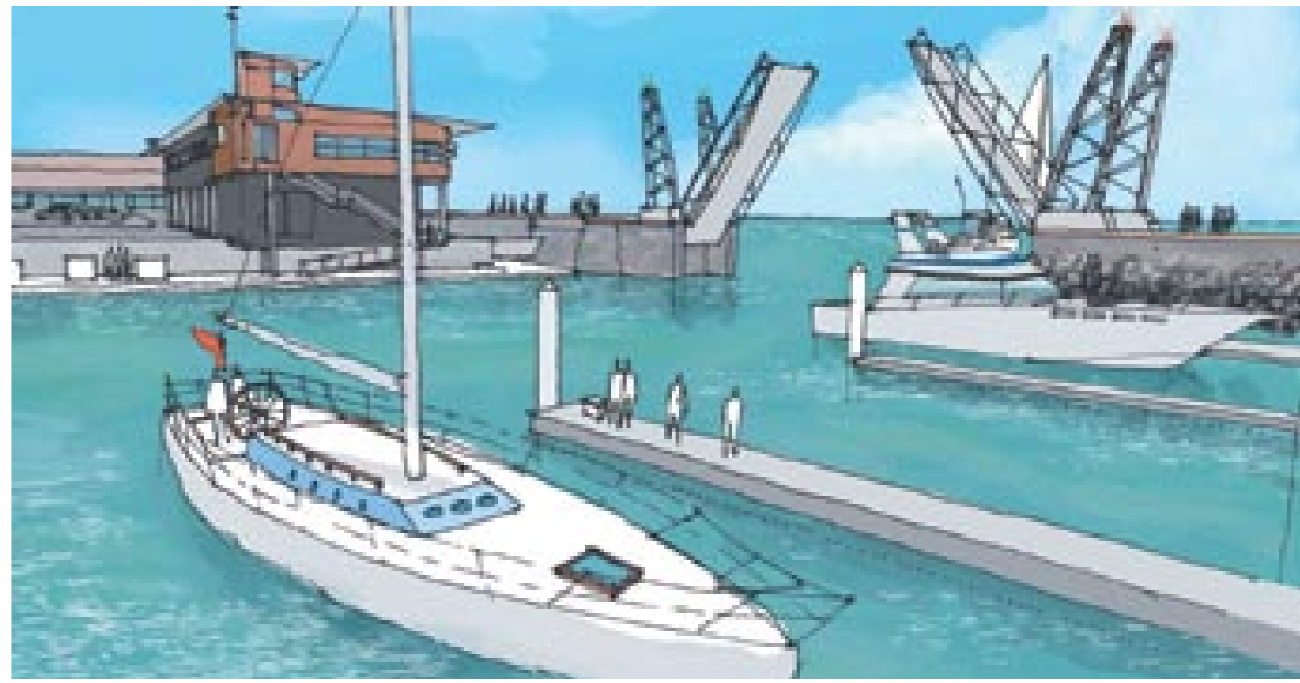
Artists impression of lifting pedestrian bridge